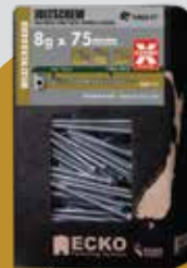
Handy Pack (500PCS)